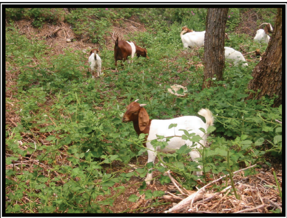
Exotic Blackberry Eradication