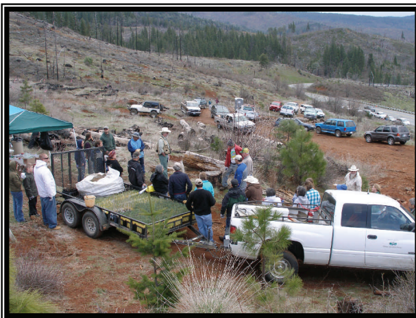
Post Fire Revegetation-Volunteer Day

The Weaverville Community Forest is located within the wildland-urban interface of the town of Weaverville in Trinity County California. Weaverville was founded in 1848 as a gold mining settlement, and is approximately 45 miles west of Redding. This historic town still exhibits much of Trinity County's 19 th century character. It is nestled in the Weaver Creek basin, surrounded by public and private forest lands, and is near the Trinity Alps Wilderness. Weaverville is Trinity County's largest community, with a population of 3,500 in an otherwise sparsely populated county (Trinity County has a population of less than 14,000).