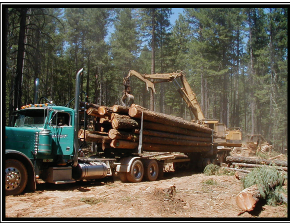
Forest Thinning and Fuels Reduction