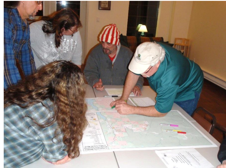
Photo: 2015 CWPP Update Mapping Exercise