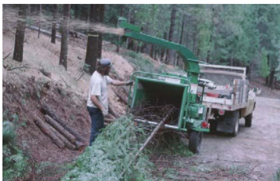
TCRCD Crew chipping excess fuels.

You will notice a meadow to your right that was mowed with fire protection and wildlife habitat concerns in mind. It is ideal for the monarch butterfly because it provides critical milkweed habitat. As you continue up Timber Ridge Rd, you can see many homeowners' fuels reduction efforts. Trinity County Resource Conservation District (TCRCD) staff advised interested landowners on how to do fuels reduction thinning on their property. Homeowners did the work and piled the resulting wood. TCRCD brought in a chipper and spread the chips onto the ground. Over half of the neighborhood has participated thus far. Currently, landowners are thinning dense stands and trimming limbs to reduce ladder fuels. At the same time, the TCRCD has been working with the Bureau of Land Management (BLM) and adjacent landowners to design a shaded fuel break on the ridge above the subdivision to protect the homes.