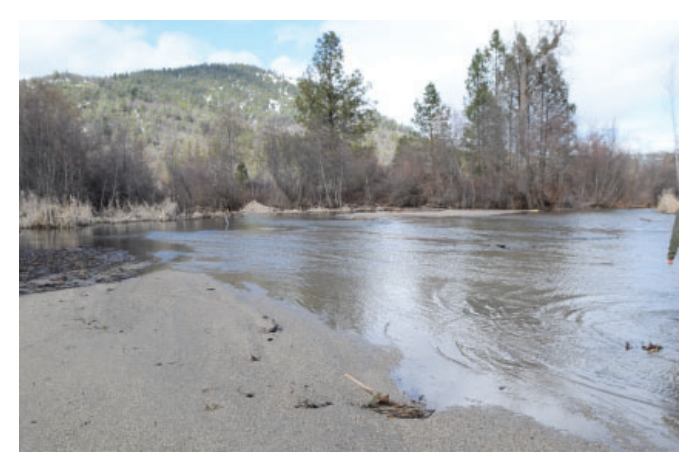
Photo 3. Hamilton Ponds were built to prevent decomposed granite and fine sediment from Grass Valley Creek from building up in the Trinity River