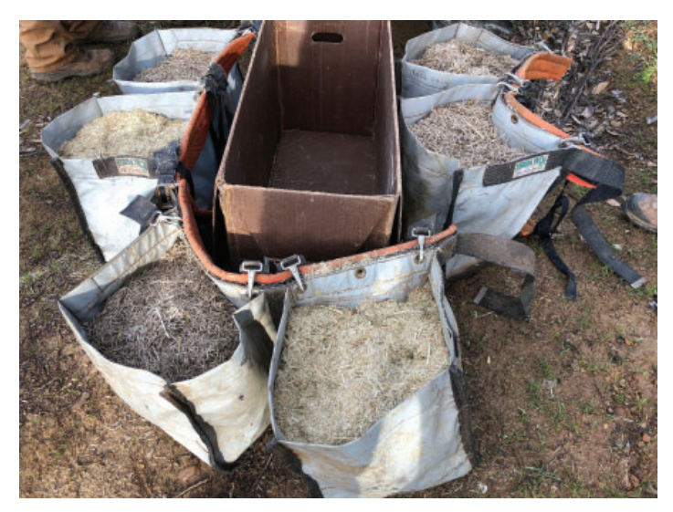
Native grass seed in bags ready for broadcasting

The District's Native Plant Nursery continued to expand in 2018, with generous support from Caltrans. Twenty-four different species of native seed were collected, treated, stratified, and propagated at the nursery, which added valuable diversity for revegetation projects. Plants grown from local seed are more adapted to the harsh climate, poor soils, and unique topography found in Trinity County, ultimately contributing to healthier and more resilient ecosystems.