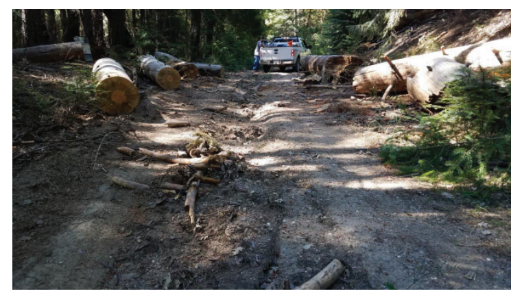
Gully from poor road drainage