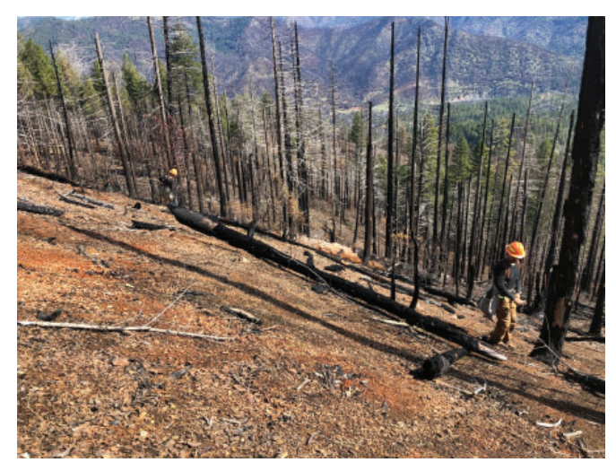
Hand broadcasting native grass seed