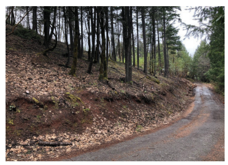
Roadside shaded fuel break along South Ridge Road in the Timber Ridge area of Weaverville

One excellent example of this is the Timber Ridge Community Fuel Break, a 30-acre contiguous project forming a protective buffer around the Timber Ridge subdivision in Weaverville. Once completed, it will provide an anchor point for fire suppression efforts in the Wildland Urban Interface south of Weaverville, and tie in with fuels reduction treatments the BLM is implementing in the Weaverville Community Forest.