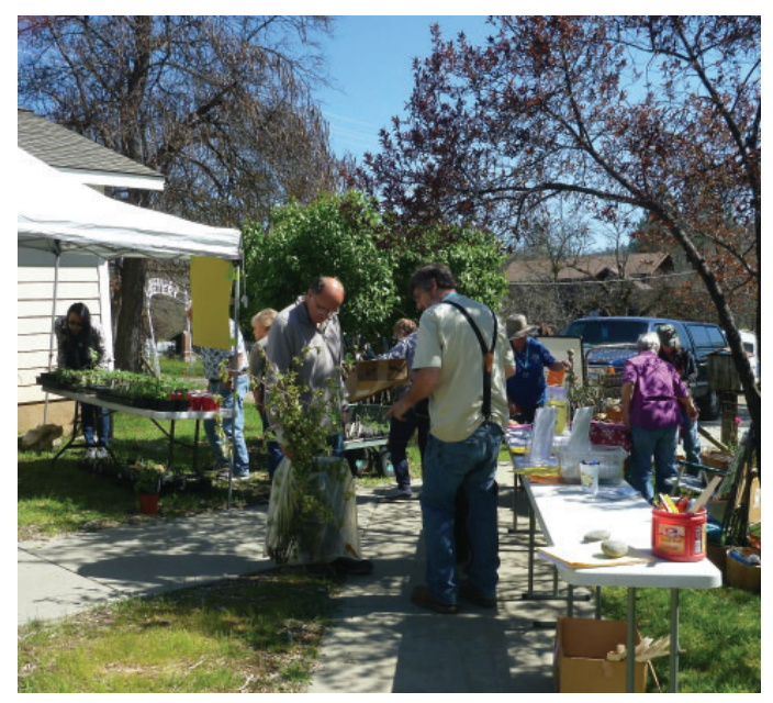
Annual Trinity County Plant and Seed Exchange

Through an agreement with the Young Family Ranch, inc. trustees, the District manages the ground work, day-to-day operations, and coordination of programs and events at the Young Family Ranch. In 2018 the District co-organized the annual Trinity County Plant and Seed Exchange in April; brought back the old time ranch feel at the first annual Weaverville Frontier Days in May; managed and implemented Weaverville Summer Day Camp, a three week-long summer camp in July; and co-coordinated the second annual Apple