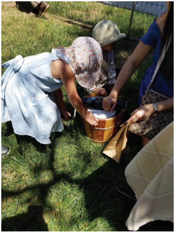
Hand cranked ice cream at the 2018 Frontier Day Festival

This would not have been possible without support from Trinity Trust, Humboldt Area Foundation, UC Cooperative Extension, UC Master Gardeners, UC CalFresh, Young Family Ranch volunteer Board of trustees, and many others who supported these events.