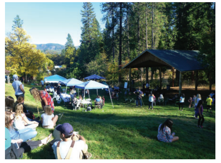
2018 Apple Festival