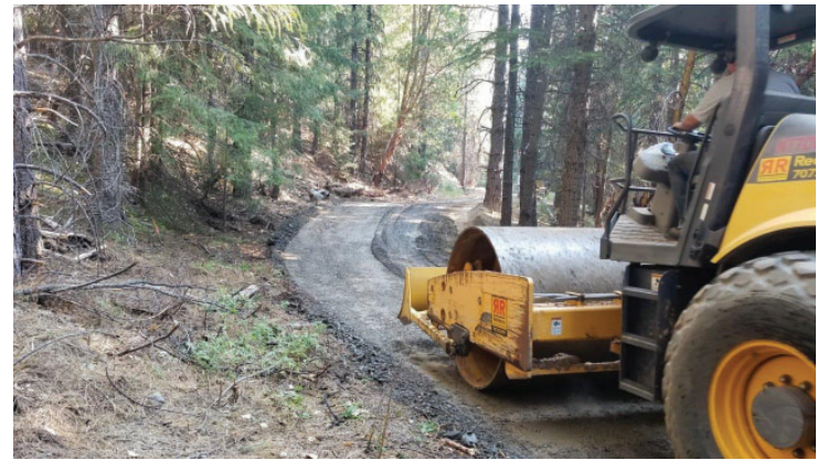
Construction, rocking, and compaction of a rolling dip