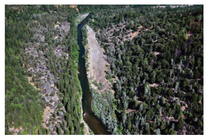
Photo 2. The Dutch Creek site, several miles from the Chapman Ranch site, is proposed for construction in the summer of 2020. This straight stretch of river is cut-off from the floodplain and offers little habitat for young fish, especially during higher flows

Please visit www.trrp.net for more information, technical reports, other products and links to partner and cooperator information.