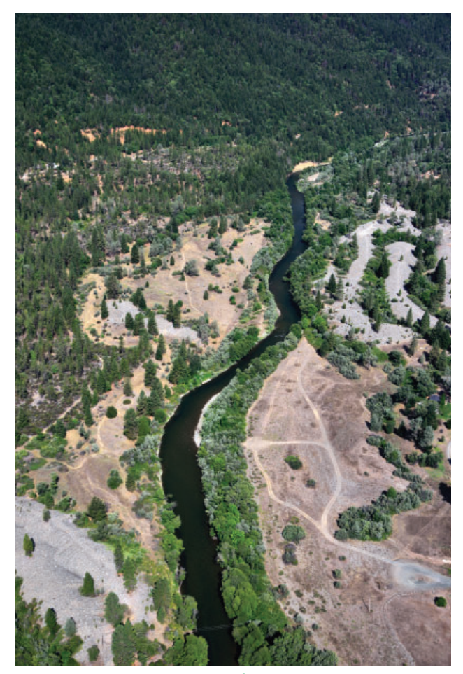
Photo 1. Aerial photograph of the Chapman Ranch site, which is proposed for construction in the summer of 2019

On a highly regulated and managed river like the Trinity River ecological disruption is unavoidable; But with focused and continued effort that works toward maintaining and recovering natural river processes, wild salmon and steelhead can return to the Trinity in strong numbers.