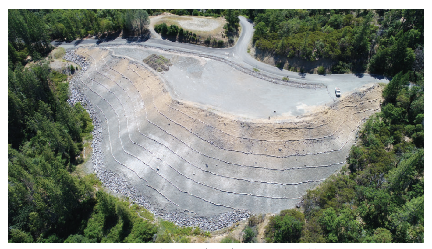
Corral Bottom disposal site of debris from Big French Creek Slide