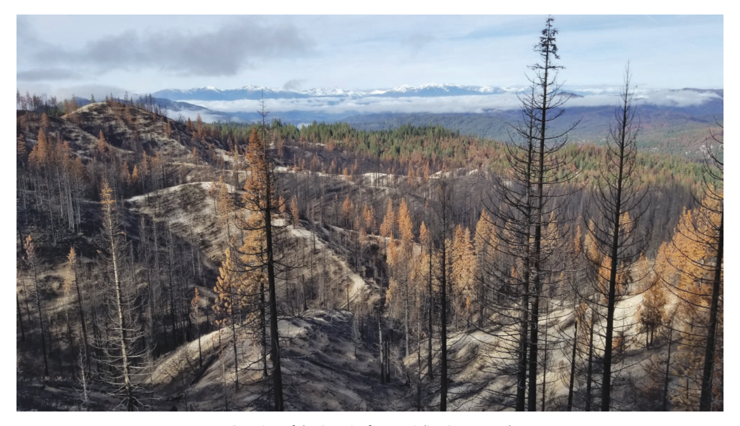
Overview of the Carr Fire from Mainline Spur A Road

On July 23, 2018 the Carr Fire started along Highway 299 in the area of French Gulch, CA. In total, the fire burned almost 230,000 acres in Shasta and Trinity Counties including almost 64,000 acres of land managed by the Bureau of Land Management (BLM). Some of the BLM managed lands affected are within the Grass Valley Creek watershed, which is a large tributary to the Trinity River. Grass Valley Creek is comprised primarily of decomposed granite soils, sometimes referred to as DG. This soil type is highly erosive and susceptible to common erosion features like rill and gullying (See photos on the next page).