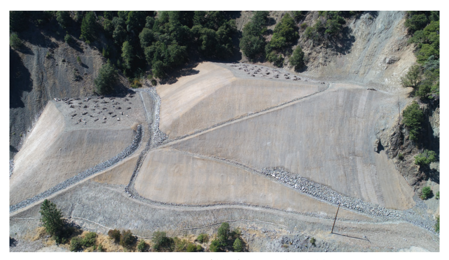
Burnt Ranch disposal site of debris from Big French Creek Slide