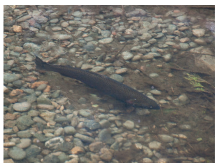
Figure 1. Spawned salmon are seen in the Trinity River just below the confluence of Dead Wood Creek after it was burned in the Carr Fire