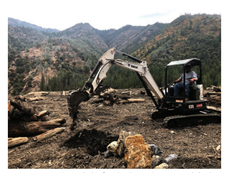
Digging holes for planting native trees and shrubs