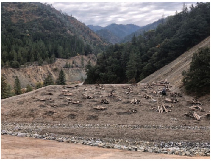
Revegetation at Big French Creek disposal site

The RCD completed revegetation of two of the four disposal sites in 2018, replanting 5.23 acres with native tree and shrub species, about half of which were grown at the Trinity County RCD Native Plant Nursery from local seed. A mini-excavator and inmate crews were utilized to dig planting holes in the compacted, poor quality soil. Watering tubes - 2' long lengths of PVC pipe - were installed with each planting to encourage deep root growth. Over 10 cubic yards of high-quality organic soil amendment was distributed among the planting holes to introduce beneficial soil organisms and improve soil structure. Finally, 4' deer fencing was installed around each plant to prevent herbivory.