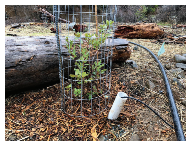
2' PVC watering tubes and 4' deer fencing installed around each plant