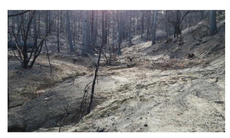
Stream crossing erosion on Mainline Spur A Road