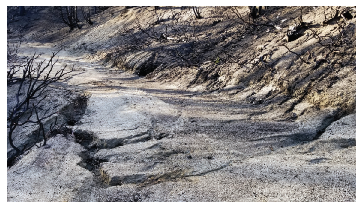
Rill and gully erosion causing road fill failures on Mainline Spur A Road