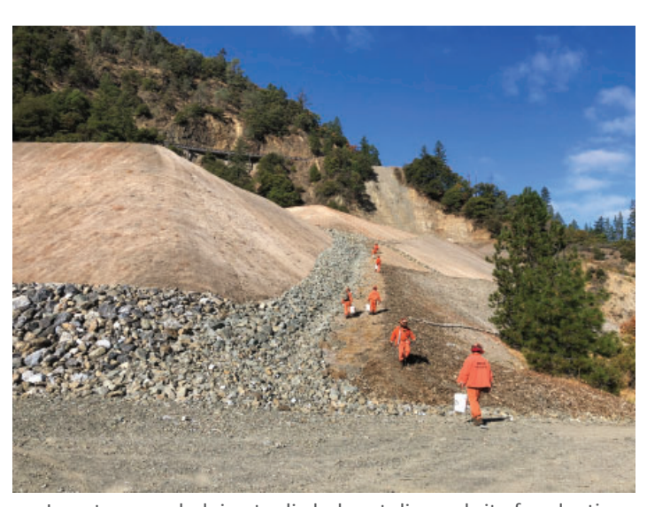
Inmate crews helping to dig holes at disposal site for planting