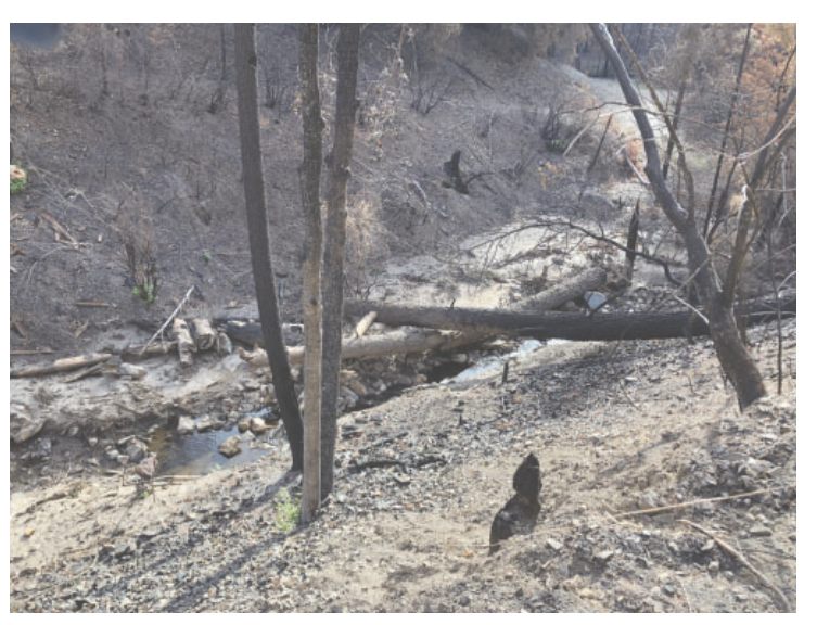
Figure 2. The Dead Wood Creek drainage in October 2018 after the Carr Fire