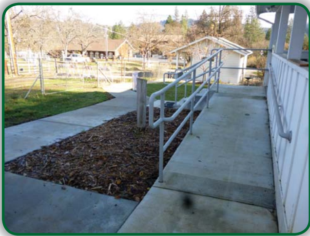
New sidewalks and ramps make the ranch house and the restrooms accessible for all.

Young Family Ranch is on Oregon St. in Weaverville. It is a non-profit public benefit trust guided by a volunteer board of trustees who ensure the property is used as its donors directed - to provide learning opportunities for all ages about agriculture, gardening and natural resources conservation. The Ranch hosts many free workshops on a variety of topics. It also hosts the annual Trinity Plant and Seed Exchange, the Weaverville Summer Day Camp program, the Trinity County Master Gardener Program, the 4-H Youth Development Program, and Trinity Homegrown Foods. To learn more about supporting the Ranch, or to share your ideas for a workshop or program, please call Mark Dowdle at TCRCDC, 623-6004.