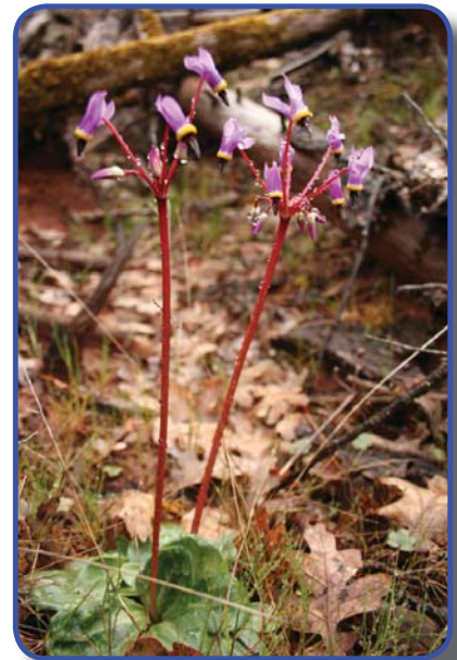
Shooting Star ( Dodecatheon hendersonii )

Mark your calendars for the Free Plant & Seed Exchange, April 20, 2013 at the Young Family Ranch. Check our website for more: www.tcrccd.net .