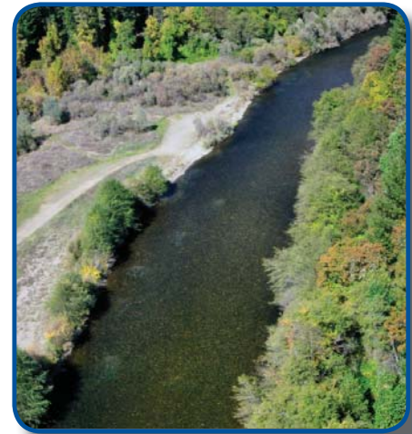
This aerial photo of the Trinity River shows redds (nests) along the left bank of the Trinity River. Look for the light-colored circles in the stream bed.