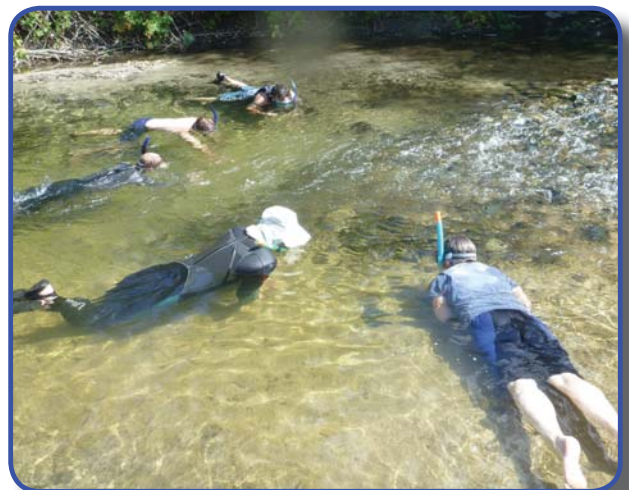
South Fork Basin Stewards learning to identify juvenile salmonids.