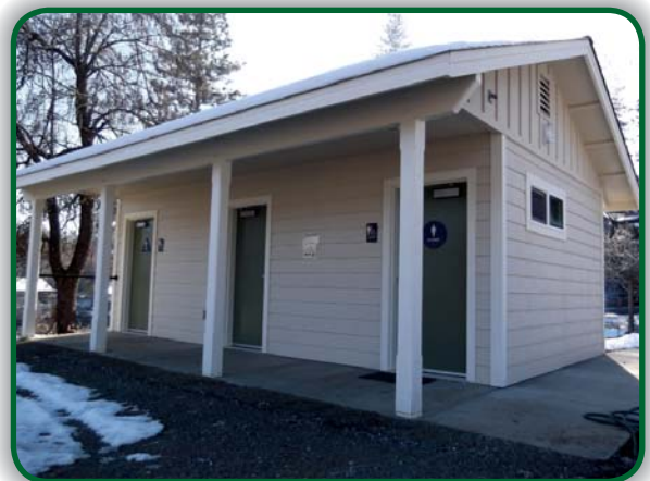
Newly completed restrooms at the Young Family Ranch.