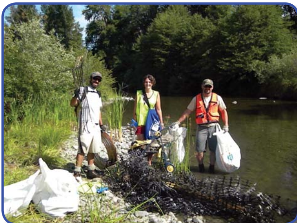
Volunteers remove garbage from Hayfork Creek in August 2012.

Volunteering is a fun way to get outside, meet your neighbors, learn something new about your watershed and accomplish important work! To sign up as a Steward, send an email with your contact information to wrtc@hayfork.net or call (530) 628-4206. Check the Watershed Center's website for updates on Stewards' events: www.thewatershedcenter.com or like them on Facebook: www.facebook.com/pages/The-Watershed-Research-and-Training-Center .